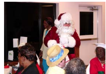
Santa at IT Council on Aging

your good works. The items that were donated for the Indiantown Council on Aging were all put in a large usable container, wrapped by youth from the leadership club and given to each of the members of the Council on Aging by Santa himself. You helped many, many people this holiday. You should feel proud.